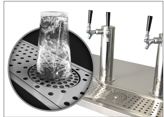
> Integrated water glass rinser