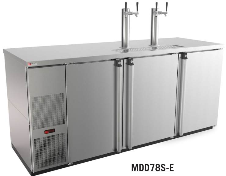
MDD78S-E Stainless Steel