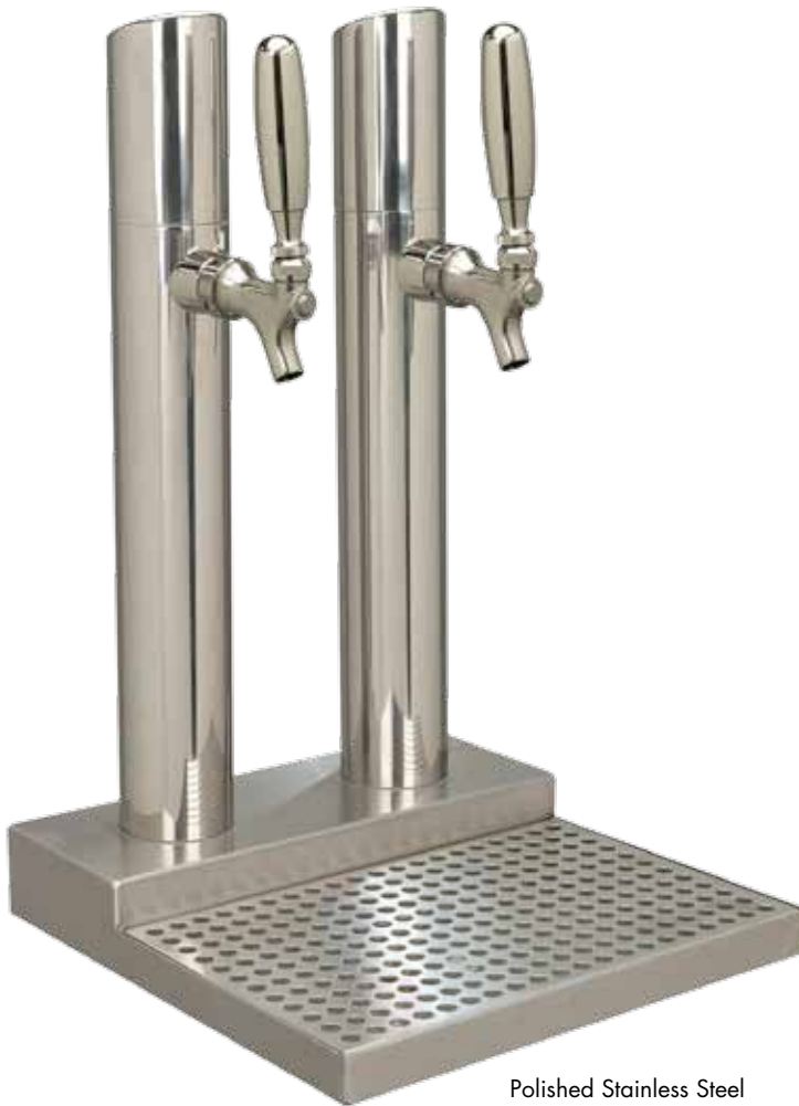
Polished Stainless Steel BS-SKY-2PSSKR-LR