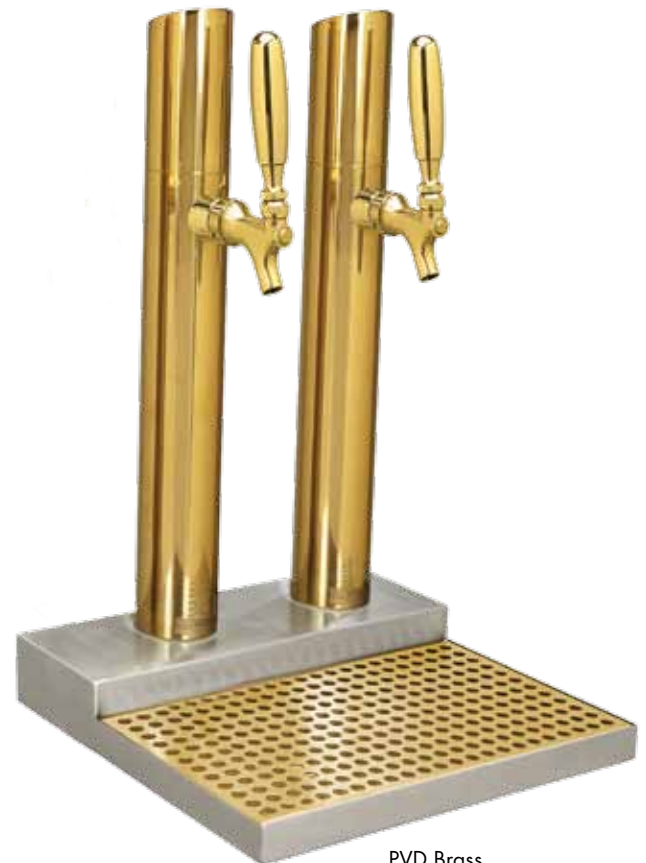
PVD Brass BS-SKY-2PVDKR-LR