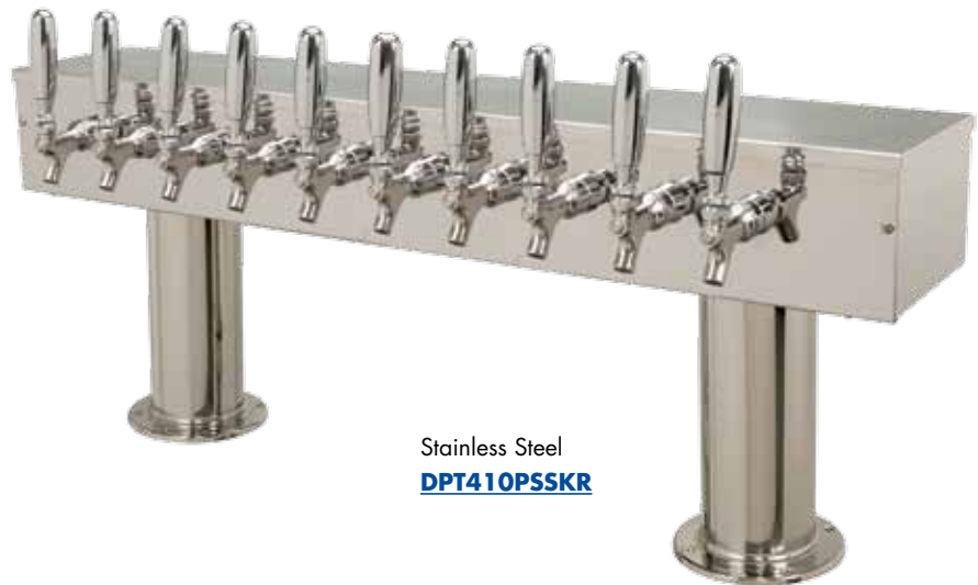
Stainless Steel DPT410PSSKR