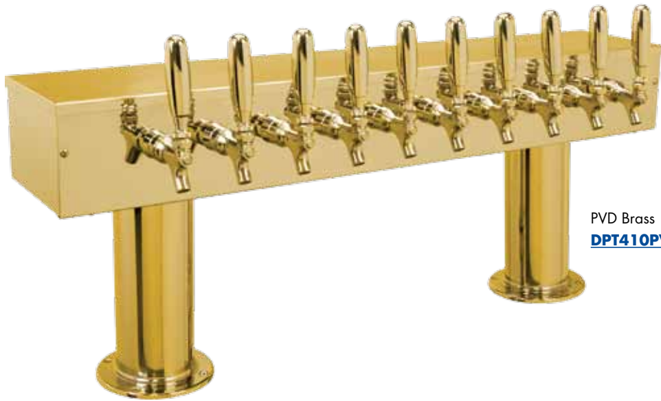
PVD Brass DPT410PVDKR