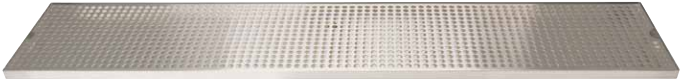
Stainless Steel DP-820D-51