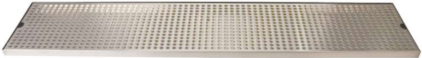
Stainless Steel DP-820D-39