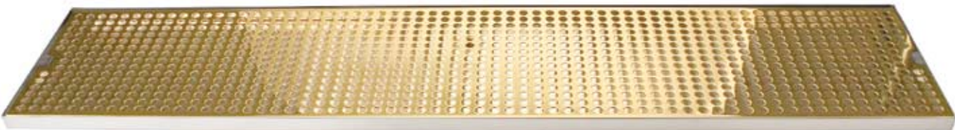
PVD Brass DP-820DSSPVD-39