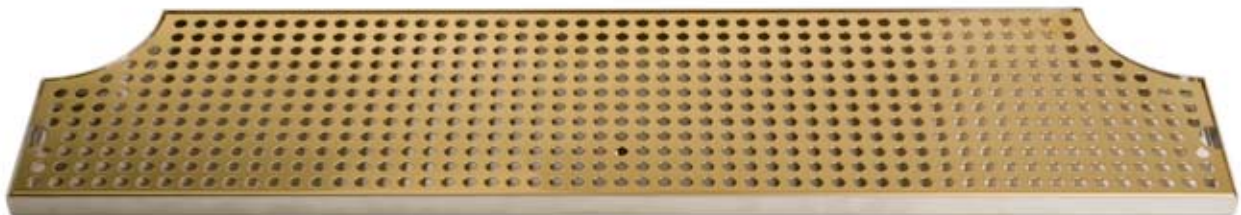
PVD Brass DP-MET-H-SSPVD-34