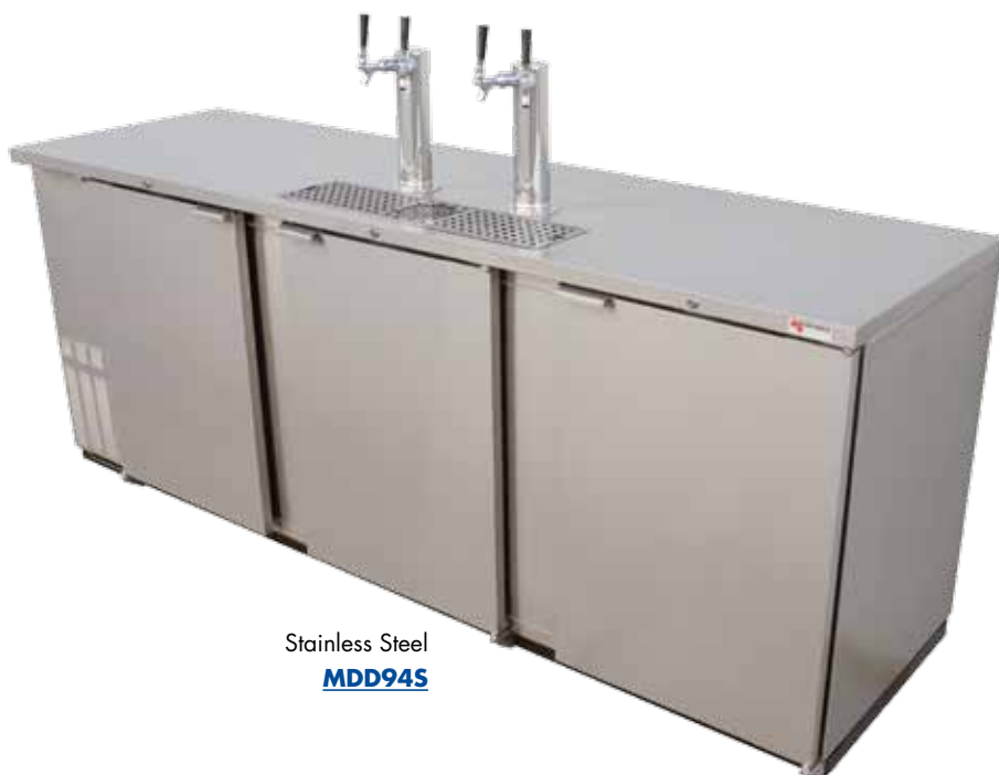
Stainless Steel MDD94S