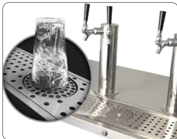
► Integrated cold water glass rinser.