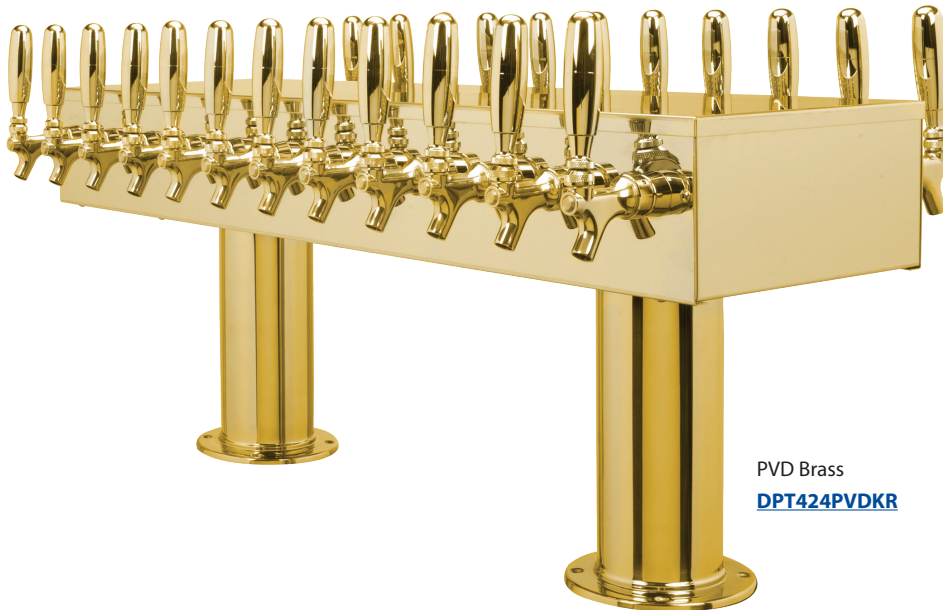
PVD Brass DPT424PVDKR