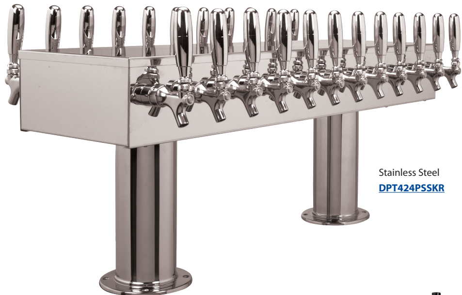
Stainless Steel DPT424PSSKR