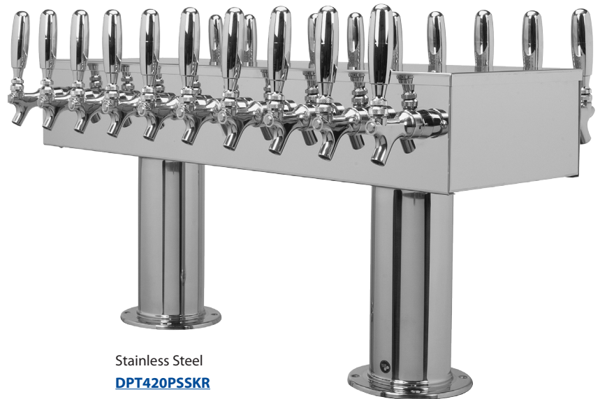
Stainless Steel DPT420PSSKR