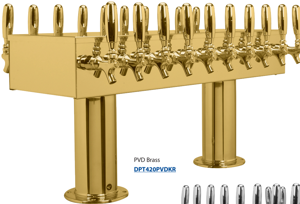
PVD Brass DPT420PVDKR